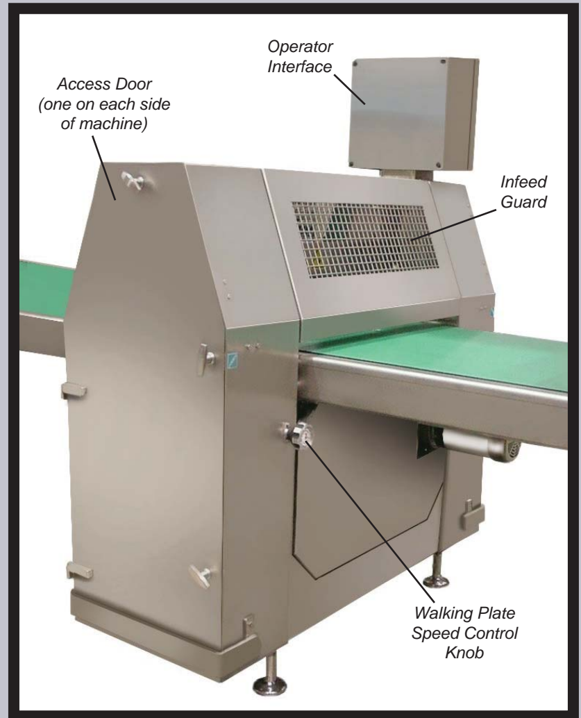
Vertical Stamping Unit